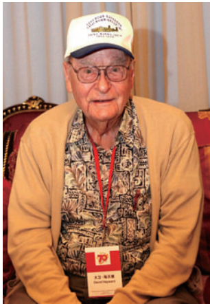
14th Air Force B-25 bomber pilot, 22nd Medium Bomb Squadron, 341st Bomb Squadron Group

Until now, my very first mission is still fresh in my mind. At that time, our crews were broken up, so we could gain experience flying with more experienced people. So, on that very first mission, I was flying as a co-pilot for a very experienced pilot, and our mission was to go to an airfield to try and destroy the air strip the enemy was using.