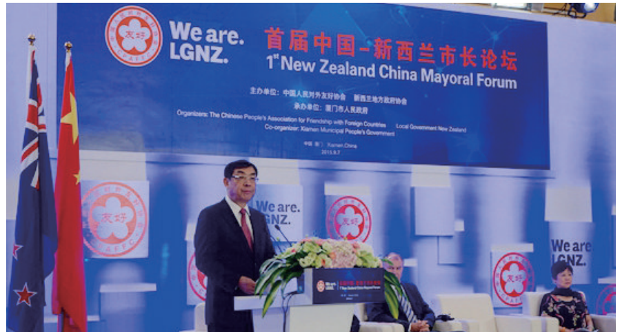
Vice Chairman of the CPPCC Ma Peihua addresses the opening ceremony

Events such as Tasting of Chinese and New Zealand Food, the Picture Exhibition of Cities in China and New Zealand, and the Seashine Group's "New Zealand Counter" opening cer-