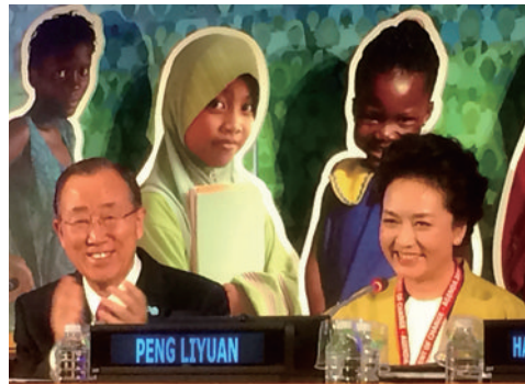
Chinese President Xi Jinping’s wife Peng Liyuan attends the opening ceremony of a high-level meeting of the “Every Woman Every Child” global movement in New York, the United States

The opening ceremony of a high-level meeting of the “Every Woman Every Child” global movement was hosted by the Executive Office of the UN Secretary General at the UN headquarters in New York on September 26, 2015, attended by about 600 delegates. The Chinese People’s Association for Friendship with Foreign Countries (CPAFFC) attended to represent all Chinese organizations involved in the movement.