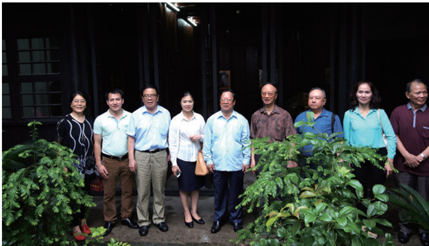
Visiting the former site of the Eighth Route Army Office in Guilin where Ho Chi Minh once worked

man Ho Chi Minh once worked and lived, and attending friendship activities in the cities of Fangchenggang, Guilin, Nanning, Baise and Chongzuo, the Journey and Gala helped people recall the remarkable contribution made by the late Chinese and Vietnamese state leaders and promote bilateral friendship. Both sides spoke highly of the event and agreed to launch a number of cooperative projects. ■