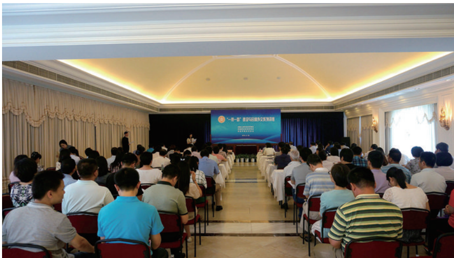
A scene of the first lecture