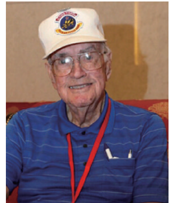
USAAF Troop Carrier Command, C-47 & C-46 Hump Airlift pilot

I still keep many of the articles I used in China, such as maps, money, etc., because they are memorial for the war and are invaluable in my heart. There was a translation book called "Pointie Talkie" which was intended for use in the event of being downed over China. To communicate with any native Chinese encountered, the pilots would find a phrase in English and point to the Chinese language translation. For example the pilots could ask a question such as "please show me on any map you may have where I am."