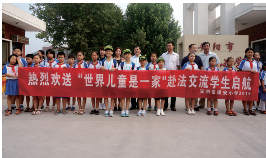
A see-off ceremony for four Chinese primary school students to France

The healthy, positive, lively and friendly spirit shown by the Chinese children as well as their unity and modesty received high praises from the president of the SPF. French media at all levels reported the activity. Radio France International broadcast a live interview with the Chinese students. After returning to China, three of them wrote articles about the activities. ■