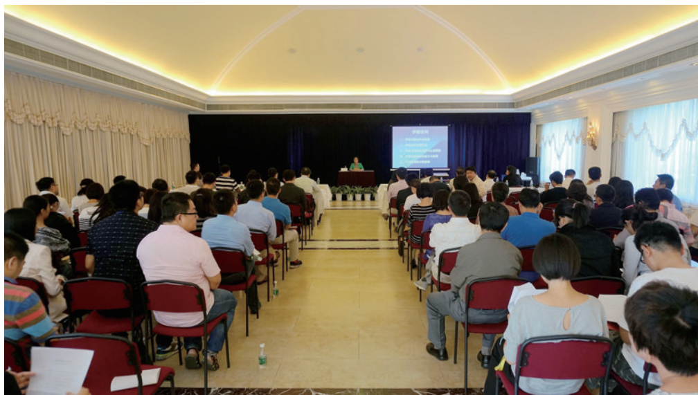
A scene of the second lecture

Considering the situation at home and abroad and suggestions from the audience, the CPAFFC will continue to invite experts from various sectors to give lectures. ■