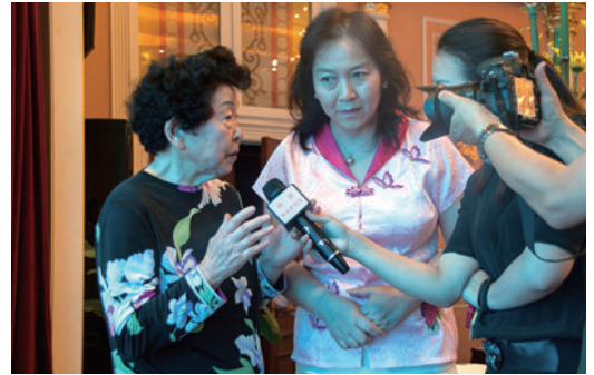
Interviewed by CCTV

"Flower arrangement is closely linked with philosophy, literature and painting. Traditional Chinese flower arrangement stresses a natural demonstration of the flower's charm and the creation of a beautiful scene in a poetic