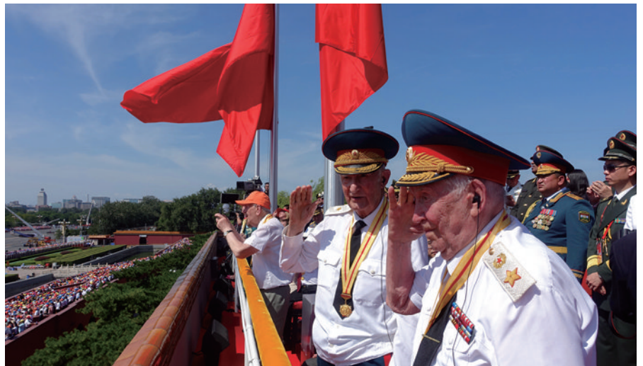
Two veterans from Russia on the Tien An Men rostrum

General Shudlo, 88, participated in all the activities in Beijing marking the 70 th anniversary of the victory of the Chinese War of Resistance against Japanese Aggression and world victory against fascism.